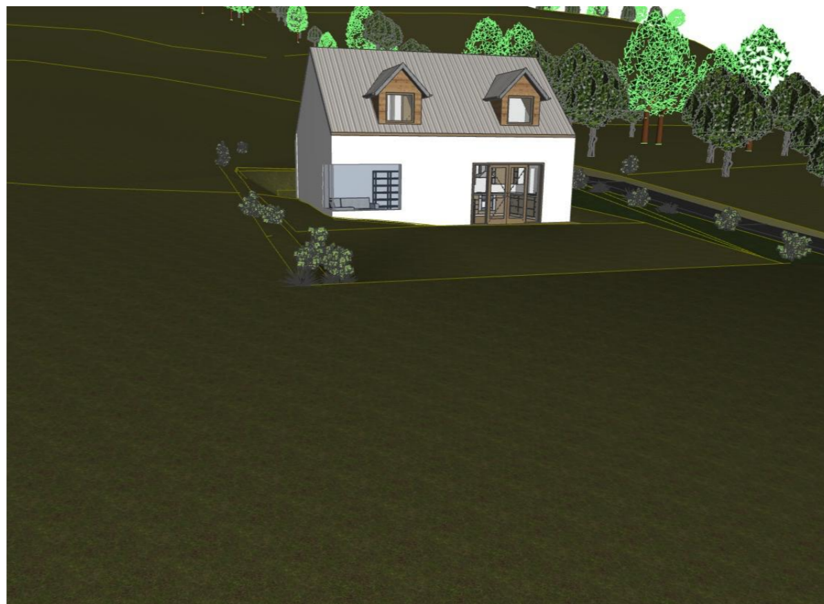
1:125 View from Hill Below