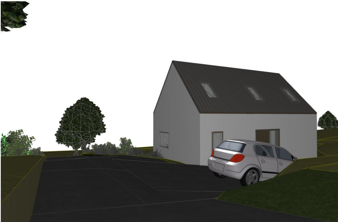
1:125 View from Road